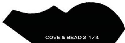
CR- 2 1/4 COVE & BEAD