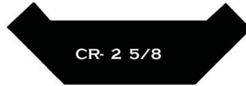
CR- 2 5/8