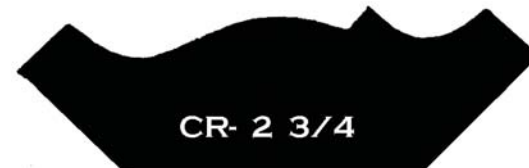
CR- 2 3/4