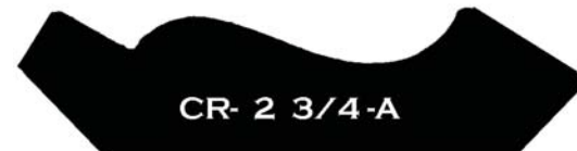
CR- 2 3/4-A