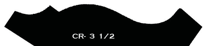
CR- 3 1/2