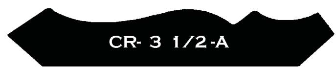
CR- 3 1/2-A