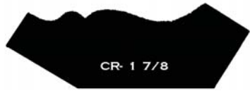
CR- 1 7/8