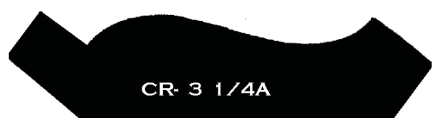
CR- 3 1/4A