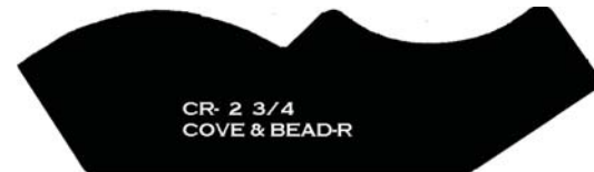
CR- 2 3/4 COVE & BEAD