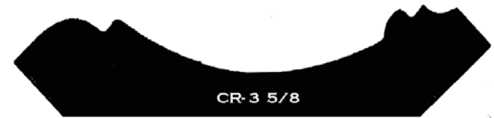
CR- 3 5/8-A