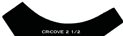
CR- 2 1/2 COVE