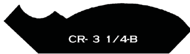
CR- 3 1/4B