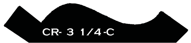
CR- 3 1/4-C