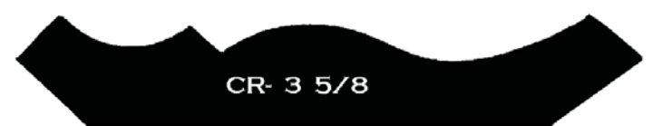
CR- 3 5/8