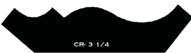
CR- 3 1/4