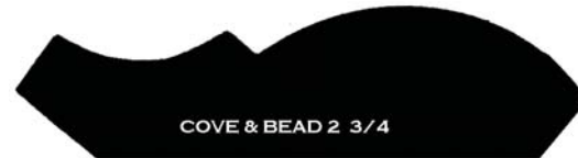
CR- 2 3/4 COVE & BEAD