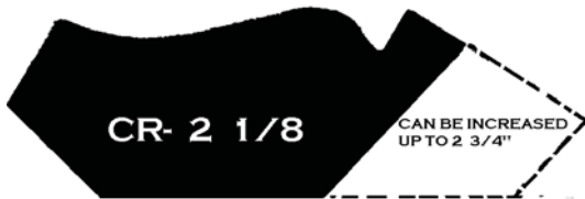
CR- 2 1/8