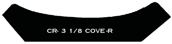
CR- 3 1/8 COVE-R